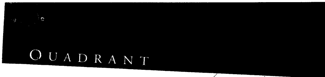
EXHIBIT No. 7 Clerk